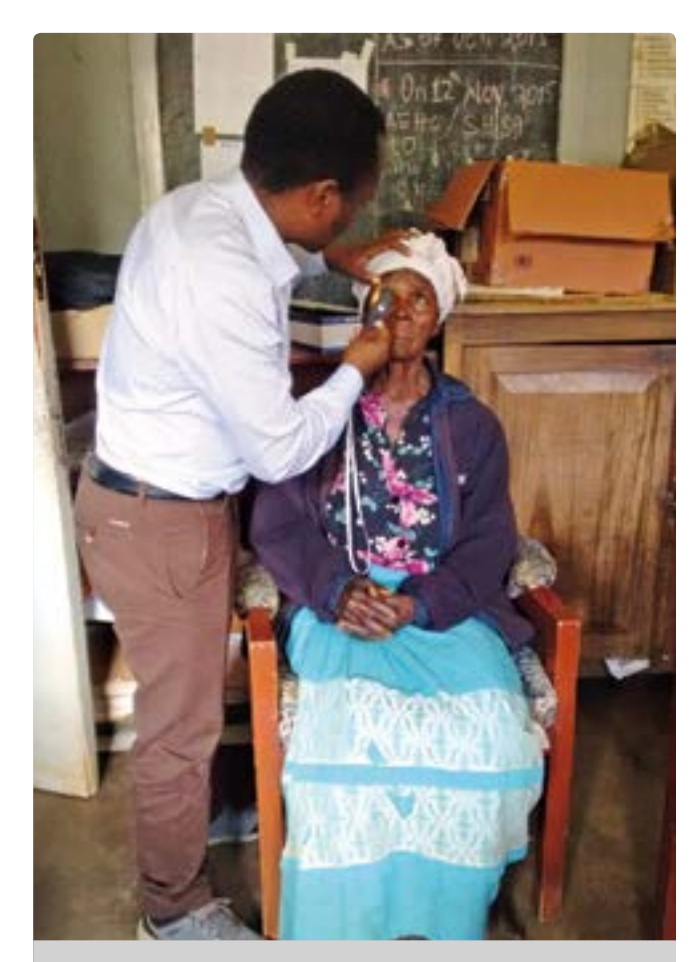
An ophthalmic clinical officer examining a patient at a cataract screening camp in Kasungu, Malawi.

The 2030 Agenda for Sustainable Development has set out to address exclusion and ensure no one is left behind<sup>2</sup>. The Agenda references disability specifically in five goals and seven targets, and commits countries to disaggregating data by disability across a number of indicators<sup>3</sup>. Better, more accurate data on people with disabilities – and on other people who experience exclusion – is required if Agenda 2030 is to deliver lasting change. Greater collaboration between governments, multilateral and donor agencies, and civil society is required to promote, collect, analyse and report better data on disability.