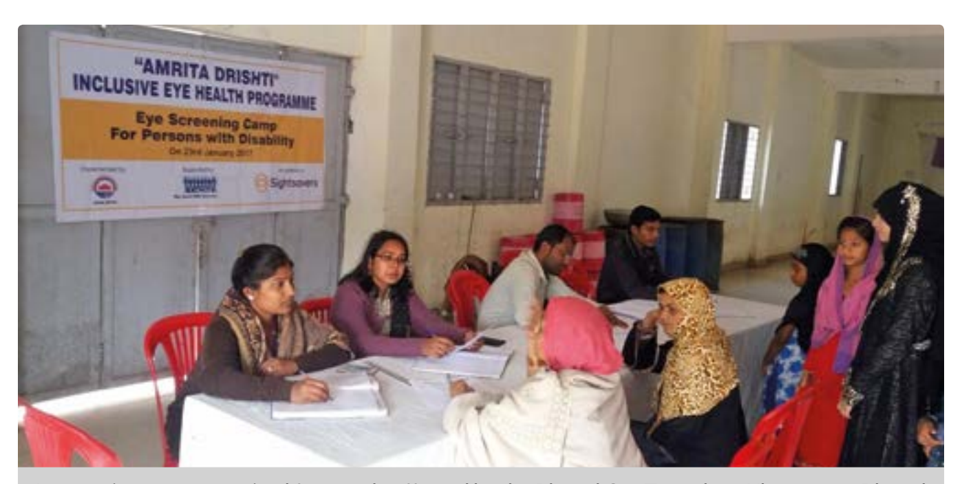
A screening camp organised for people affected by the Bhopal Gas Tragedy at Khanugaon, Bhopal.

In Malawi we integrated the WGSS into data collection systems at a TT camp in our Coordinated Approach to Community Health project. In this pilot, we also used The Equity Tool<sup>6</sup>, which allowed us to disaggregate data by socio-economic status using an asset-based measure of wealth. We collected data on 545 patients over a six-day period.