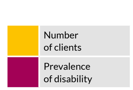
Malawi – Project clients in each of the national wealth quintiles