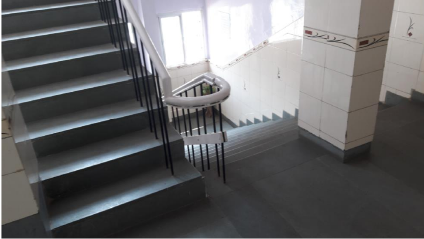
Figure 2. SSEH – Handrails are provided on one side only and there are no contrast colour edges on the step.