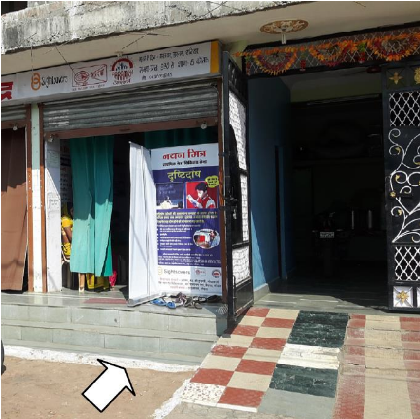
Figure 3. Anand Nagar vision centre – Steps mark the entrance to the centre and step risers are unequal. No handrails are provided. A ramp with gliders is provided in the adjacent building, which has a side entrance to the centre.