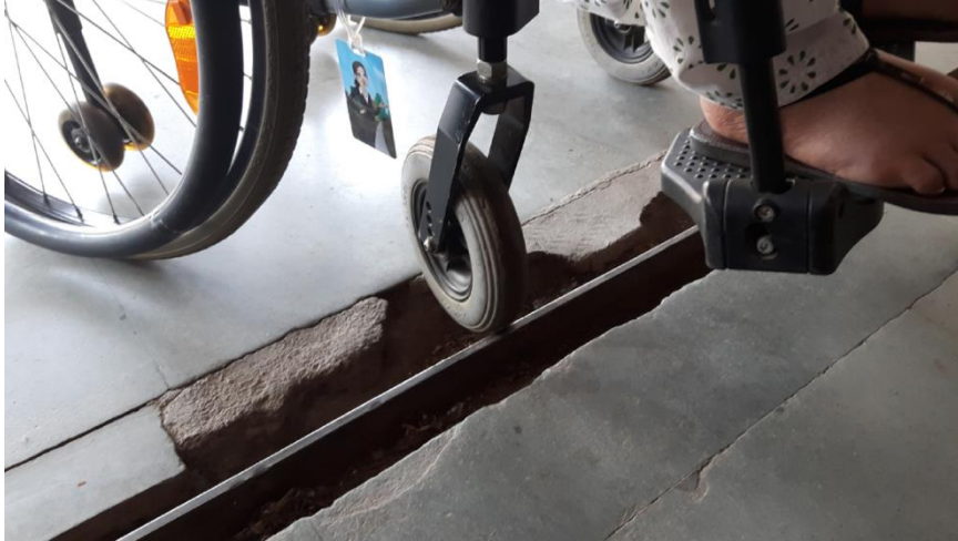
Figure 4. Gandhinagar vision centre – The channel of the iron gate creates a gap between the ramp and the flooring, and is potentially hazardous for people using mobility aids, such as wheelchairs and white canes.

Following the audits, Samarthyam submitted a report, and Sightsavers and its partners worked with an engineer to evaluate the cost of the interventions required to make the health facilities universally accessible. A plan was subsequently elaborated to identify short-, medium- and long-term priorities, and works are scheduled to begin in July 2016.