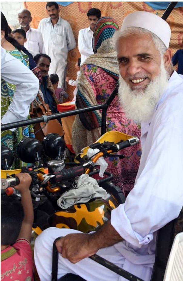
A man attending an Inclusive Eye Health outreach camp in Barakoh outside Islamabad, Pakistan.