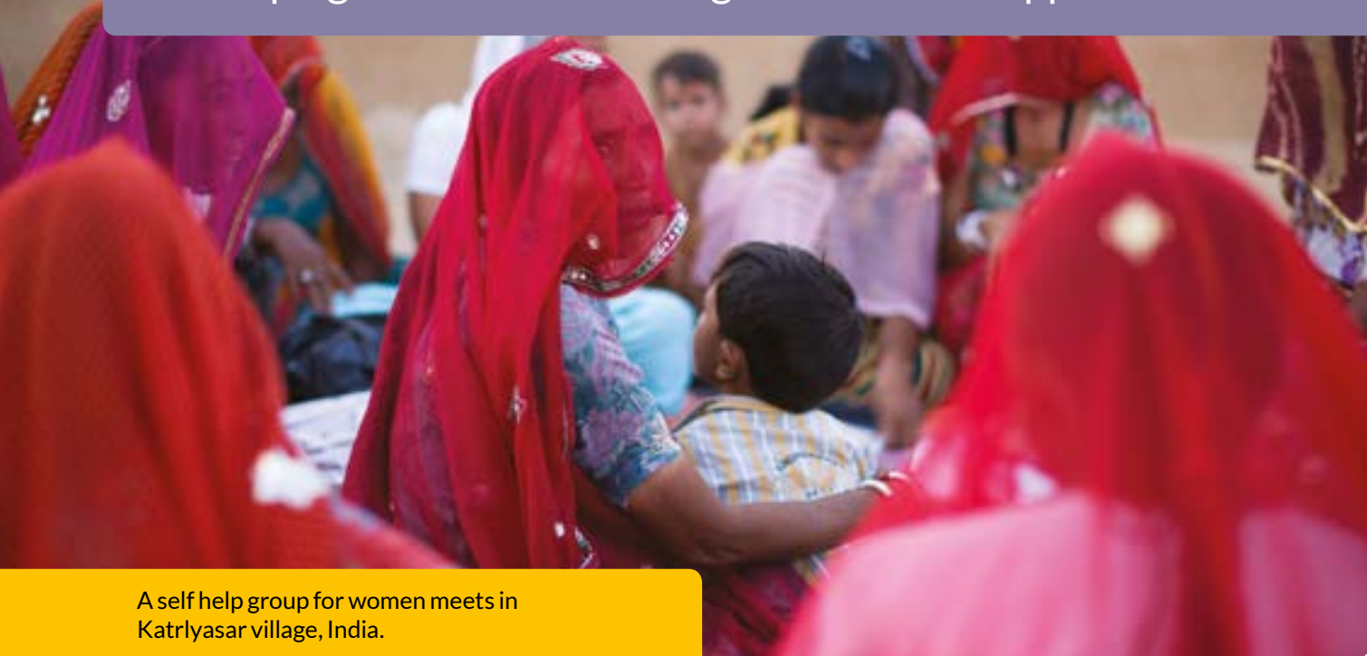
A self help group for women meets in Katrlyasar village, India.

Developing effective influencing interventions/approaches