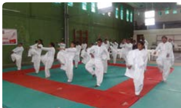
Visually impaired young women take part in self-defence training in Bhopal, India.